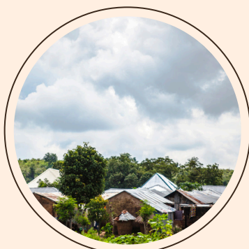
DAY 11: MAKURDI TO ENUGU

Another day on the road will bring us through farmland and small villages. As the journey progresses towards Udi Hills, the terrain becomes more rugged, with rolling hills and dense vegetation lining the roadside. Upon reaching Udi Hills, we can marvel at the breathtaking vistas and panoramic views that stretch across the surrounding countryside. Continuing onward to Enugu, the road may wind through valleys and river valleys, offering glimpses of the region's diverse ecosystems and wildlife.