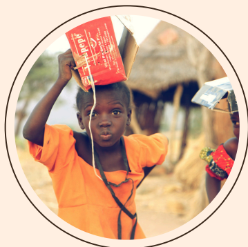
DAY 13: ENUGU TO OWERRI

Today we will drive from Enugu to Owerri with a stop at the Ogbunike Caves. Departing from Enugu, we will initially follow well-maintained highways that wind through lush countryside, providing scenic views of rolling hills and small villages along the way. As we reach the Ogbunike Caves, the terrain becomes more rugged, with winding roads leading through dense forests and rocky outcrops. We will join a tour of this natural wonder, exploring the network of caves and caverns that have been formed over centuries. Afterward we continue onward to Owerri where we will have the afternoon to relax and unwind at the Ngwoma Forest Park.