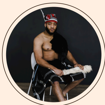
DAY 14: OWERRI

We start our day with a visit to the Mbari Cultural and Art Center, a vibrant hub of Igbo culture and heritage. Explore the intricately designed sculptures and artifacts that adorn the center, offering insights into the rich traditions of the Igbo people. In the afternoon, we will visit Oguta Lake, one of the largest natural lakes in Nigeria. Embark on a serene boat ride across the tranquil waters, taking in panoramic views of the surrounding greenery and picturesque landscapes. As you glide along the lake, keep an eye out for diverse bird species and aquatic life that call this ecosystem home.