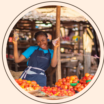
DAY 12: ENUGU

THE GIANT OF AFRICA, A COUNTRY OF IMMENSE DIVERSITY, VIBRANT CULTURES, AND BREATHTAKING NATURAL BEAUTY