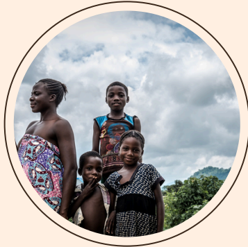
DAY 9: JOS

THE GIANT OF AFRICA, A COUNTRY OF IMMENSE DIVERSITY, VIBRANT CULTURES, AND BREATHTAKING NATURAL BEAUTY