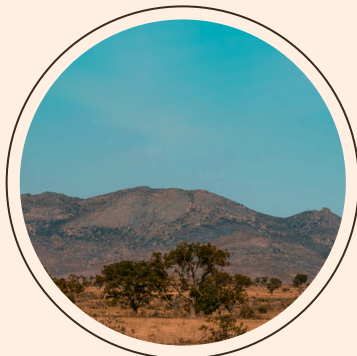
DAY 10: JOS TO MAKURDI

Departing from Jos, we will initially follow well-maintained highways that wind through rolling hills and picturesque valleys, providing stunning views of the surrounding countryside. As the journey progresses towards Riyom Rock, the terrain may become more rugged, with rocky outcrops and dense vegetation lining the roadside. Upon reaching Riyom Rock, we can marvel at the imposing granite formation that rises majestically from the earth, offering a dramatic backdrop against the sky. Continuing onward to Makurdi, the road may wind through lush farmland and small villages, offering yet another glimpse of rural life in Nigeria. As we approach Makurdi, the landscape opens up into vast plains dotted with clusters of trees and occasional rivers or streams.