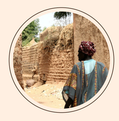
DAY 2: BAMAKO TO SÉGOU

After breakfast we will depart, with Ségou as the end destination for today. Our first stop will be in Bambara, without a doubt one of the most pleasant cities in Mali. It has tree-lined avenues, colonial neighborhoods and a decently sized river port. Along the way we can admire the enormous baobabs. Today will take us along magnificent views, with enough time to stop and visit some towns that we will find along the way. In the late afternoon, we will take a walk along the river to admire the sunset followed by a millet beer distillery