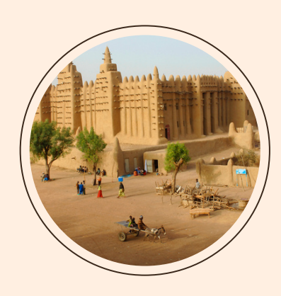
DAY 4: MOPTI

Today we will spend our day in and around Mopti. We will start at the riverbanks, catching glimpses of local fishermen and bustling riverfront communities. We will visit the "Women's Village" or "Nder". This village is exclusively inhabited by women and their children, as it serves as a sanctuary for women who have faced various challenges. For a deeper dive into Mali's rich heritage, visit the iconic Komoguel Mosque, an architectural marvel that stands as a symbol of the city's Islamic traditions. Finally, we round off our day with a visit to the lively Fulani quarter, where you can sample delicious local cuisine and experience the warm hospitality of the Malian people.