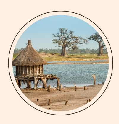
DAY 13: DAKAR TO BANJUL

After breakfast we start on the scenic journey along the West African coast from Dakar to Banjul. Departing from Dakar, the road initially follows the coastline, offering stunning views of the Atlantic Ocean and sandy beaches. As we cross into The Gambia, the landscape transitions into lush mangrove forests and palm-fringed shores, providing glimpses of local fishing villages and traditional life along the way. Eventually, the road leads to Banjul, the capital city of Gambia.