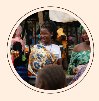
DAY 14: BANJUL

After breakfast we make our way to the Medina Jambor school, subsidized by an NGO from Girona. We will then continue the road towards Lamin Lodge, a restaurant in the mangroves of a Gambian tributary river, where we will stop for a snack. We will continue to Serekunda, the largest city in the Gambia, where we will have the opportunity to find the most beautiful fabrics in the country. After Serekunda, we will stop for lunch at the Blue Kitchen restaurant, after which we will head to Tanji, the Gambia's stunning and largest fishing village, to watch the arrival of the boats and fish market. We will also visit the fish smokehouses before we return to our hotel in Banjul.