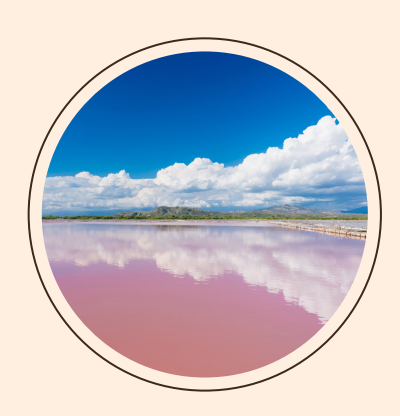
DAY 11: SAINT LOUIS TO LAKE ROSE

Departing from the historic city of Saint Louis, the road initially follows the meandering Senegal River, offering picturesque views of the surrounding wetlands and wildlife. As we continue southward, the landscape transitions into open savannah dotted with baobab trees and small villages, providing glimpses of rural life in Senegal. Eventually, the road leads to Lake Rose, a natural wonder known for its striking pink hue caused by high salt content and unique microorganisms. We will pay a visit to the village Kayar, a picturesque and traditional Serer fishing Village.