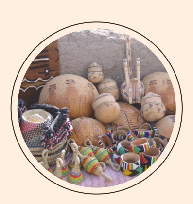
DAY 6: BAMAKO TO KENIEBA

Today we go further into west Mali, another long but exciting day on the road. We leave after a very early breakfast and as we leave Bamako behind, the scenery gradually transitions into rolling hills and fertile farmlands, with occasional views of the mighty Niger River. Finally, as the road approaches Kéniéba, the landscape becomes more rugged, with rocky terrain and sparse vegetation characteristic of the Sahelian region. The town is known for its rich cultural heritage and warm hospitality, with friendly locals eager to share their traditions and way of life. One of the highlights of Kéniéba is its vibrant market, where bustling stalls offer a colorful array of goods, from fresh produce and spices to traditional crafts and textiles.