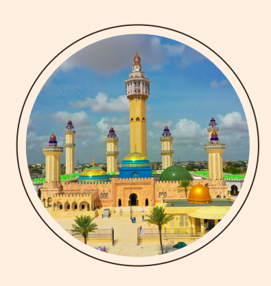
DAY 10: TAMBACOUNDA TO SAINT LOUIS

After breakfast we hit the road to the holy city of Touba where we will visit the mosque. Which is a magnificent symbol of Mouridism, adorned with intricate architecture and serving as a spiritual center for followers of the Sufi order. We continue our journey and visit a 'baifal' center for marabou apprentices, with a focus on spiritual and academic education, the center cultivates a deep understanding of religious principles, Quranic studies, and practical skills necessary for future leadership roles within the community. We continue once again and upon our arrival in Saint Louis, we will visit the heart of the old quarter of this historic city, founded by Serer fishermen and Marseille merchants who named it Saint Louis in honor of the French monarch in the 17th century.