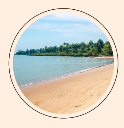
DAY 17: ORANGO TO BISSAU

After breakfast, we will sail to the island of Bolama. Once the capital of Portuguese Guinea, Bolama is dotted with colonial-era buildings and historic landmarks, including the grand Governor's Palace, which stands as a testament to the island's colonial past. We will explore its charming streets, relax on its secluded beaches, and immerse ourselves in the unique atmosphere of this tranquil island paradise. It will be a short visit, since access to this area depends on the state of the tide. In the afternoon we head back to Bissau.