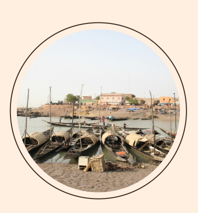
DAY 3: SÉGOU TO MOPTI

After breakfast, we hit the road towards Mopti. The road from Segou to Mopti offers a scenic journey through the heart of Mali's diverse landscapes and rural communities. After we leave the city behind us, the road soon transitions into a winding route that meanders through the picturesque countryside. Along the way, we are treated to views of fertile farmlands, traditional mud-brick villages, and the majestic Niger River, which flows gracefully alongside the road for much of the journey. All the small towns and settlements offer each a unique charm and character. Finally, after several hours of travel, the road arrives in Mopti, a bustling port city that serves as a gateway to the legendary Dogon Country and the majestic Bandiagara Escarpment.