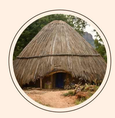
DAY 8: KEDOUGOU TO DINDEFELO

After breakfast we head out to spend our days in the mountainous region. We will visit the Bedik and Bassari ethnic groups, which are indigenous communities residing in the southeastern region of Senegal. They are known for their distinctive architecture as their intricately crafted wooden homes built into the hillsides, blending seamlessly with the natural landscape. These communities maintain rich cultural traditions, including vibrant festivals, traditional music, and spiritual practices deeply rooted in their connection to the land. In the afternoon we will go on a scenic hike through the verdant forest to reach the Dindefelo waterfall, where we can swim in the refreshing pool at its base and marvel at the beauty of the surrounding landscape. We will enjoy dinner in our tented camp