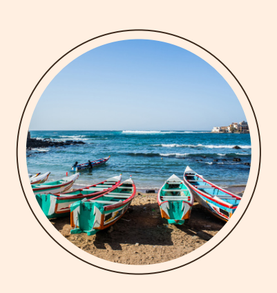
DAY 12: LAKE ROSE TO DAKAR

Today we will leave for Dakar, the capital city of Senegal. Before we head into the city, we will take the ferry to the island of Gorée. This island off the coast of Dakar holds profound historical significance as a UNESCO World Heritage Site. It is renowned for its role in the transatlantic slave trade, serving as a departure point for countless enslaved Africans forcibly transported to the Americas. We will explore its well-preserved colonial architecture, including the House of Slaves, a poignant museum that bears witness to the horrors of the slave trade. We will also enjoy the island's stunning ocean views and serene beaches. In the afternoon we head back into the city of Dakar to enjoy the evening in the city.