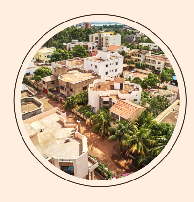
DAY 1: ARRIVAL IN BAMAKO

More information: <a href="www.westafricatracks.com">www.westafricatracks.com</a> Contact us: <a href="mailto:info@westafricatracks.com">info@westafricatracks.com</a>