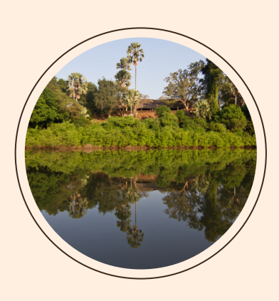
DAY 9: DINDEFELO TO TAMBACOUNDA

After breakfast we will cross to the Niokolo Koba Fauna Reserve. This reserve is a UNESCO World Heritage Site renowned for its diverse wildlife and pristine natural habitats. We might spot iconic African species such as lions, elephants, and chimpanzees in their natural environment. Then we continue our route towards Tambacounda, we will have to navigate winding roads that meander through dense forests and rolling hills. As the journey progresses, the landscape gradually transitions into open savannah, with expansive vistas stretching as far as the eye can see. Along the way, we will encounter remote villages and wildlife roaming freely.