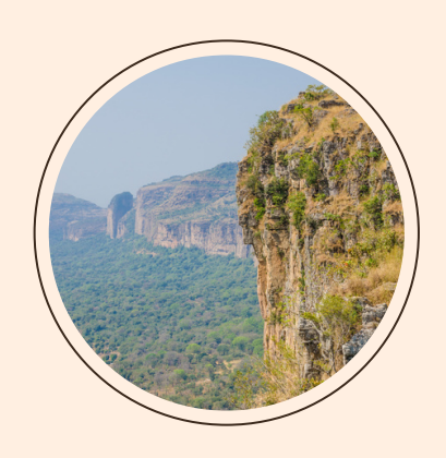
DAY 7: KENIEBA TO KEDOUGOU

We enjoy our breakfast and then continue to the nearby Faleme River Valley where we will explore the stunning landscapes, ancient rock formations, and remote villages tucked away in the wilderness. Then we continue our road passing through the rugged terrain characterized by rocky hills, sparse vegetation, and occasional clusters of acacia trees. As the road crosses into Senegal, the landscape becomes more lush and verdant, with rolling hills, dense forests, and cascading waterfalls dotting the countryside. Along the way, we may encounter remote villages and traditional settlements, where we can experience the rich culture and hospitality of the local communities. Finally, as we approach Kédougou, the landscape transitions into the lush foothills of the Fouta Djallon mountains, offering breathtaking views.